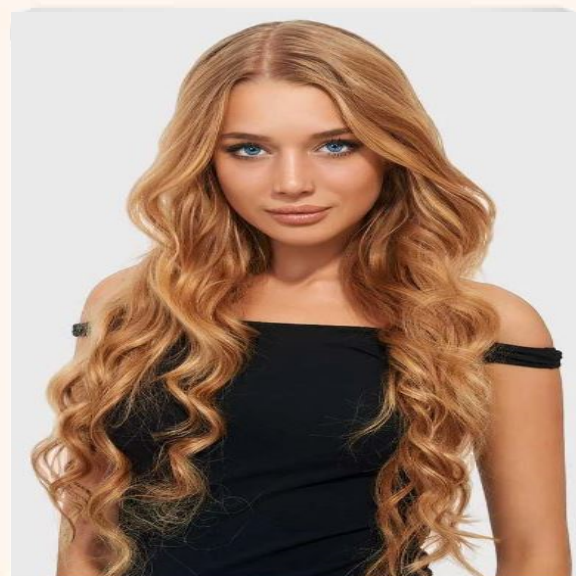
Wavy Machine Weft Hair