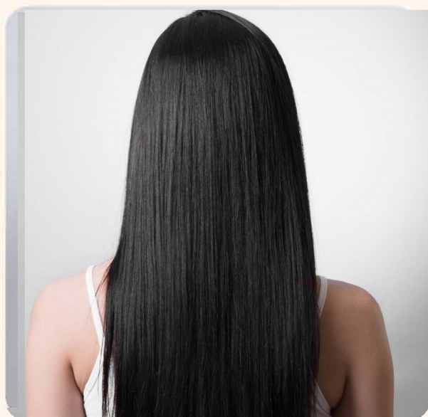
Straight Machine Weft Hair